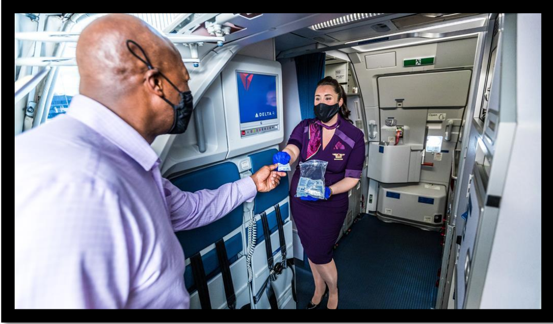
Delta flight attendant greets customer and hands them hand sanitizer