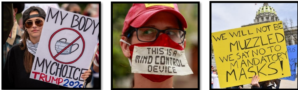
Anti-maskers are people who does not believe in the effectiveness of wearing a mask to stop the spread of COVID-19

maskers cite a variety of reasons for this belief, which range from mild to extreme. Mild anti-maskers may slightly believe masks are annoying, unfair, ugly, or just pointless, but they comply and wear them anyway. Extreme anti-maskers may additionally believe masks are a violation of freedom enforced upon them by the government, masks cause health problems from increased breathing of CO 2 , or that the coronavirus is a conspiracy theory. Extreme anti-maskers differ from mild anti-maskers because they speak out against masks and actively fight to wear a mask in public. There have been various forms of protests held by anti-maskers throughout the pandemic, from individuals personally refusing to wear masks in public spaces to groups of anti-maskers coming together for organized marches anti-mask shopping events (Stewart, 2020).