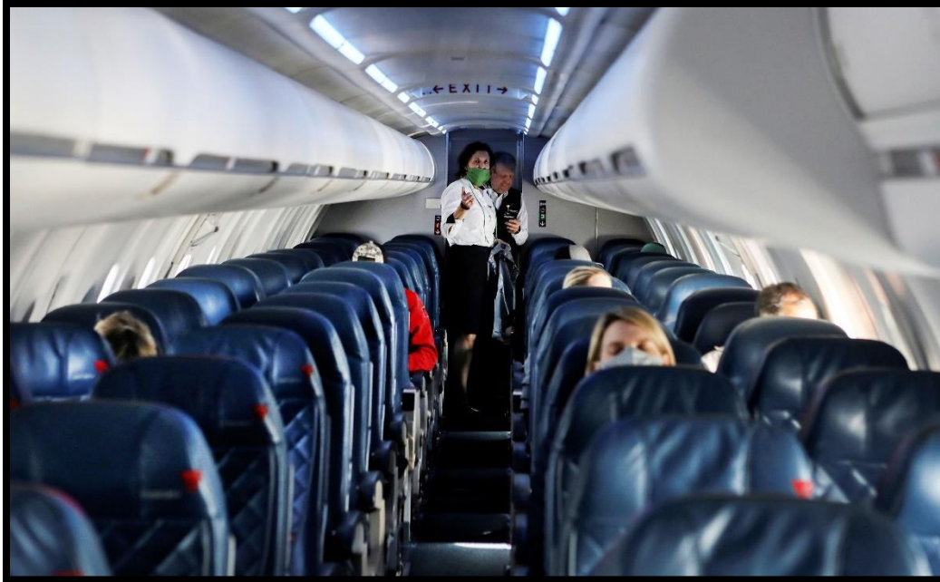
Flight attendants talk in a nearly empty cabin on a Delta Airlines flight, amid concerns of the COVID-19, during a flight from Salt Lake City, Utah, April 11, 2020

Mid-January 2020, when the viral outbreak was more of a looming threat of a larger medical emergency, the United States began running public health screenings for any travelers coming into the country from China at three major international airports, San Francisco (SFO), New York (JFK) and Los Angeles (LAX) (CDC, 2020a). Shortly after the public health screenings began, the World Health Organization (WHO) declared a global public health emergency and President Donald Trump suspended all international flight travel from and to China (AJMC, 2020). When the first case of COVID-19 hit the United States on January 20, 2020, and 87,000 global cases were recorded, Trump gave Americans a "do not travel" warning to Italy and South Korea (Taylor, 2020a). Delta was one of the airlines first impacted by this declaration, as it completely suspended its 42 weekly flights to China for eight weeks (Delta Air Lines Inc., 2020g) and reduced its weekly flights to South Korea and Italy by about one-third (Delta Air Lines Inc., 2020h).